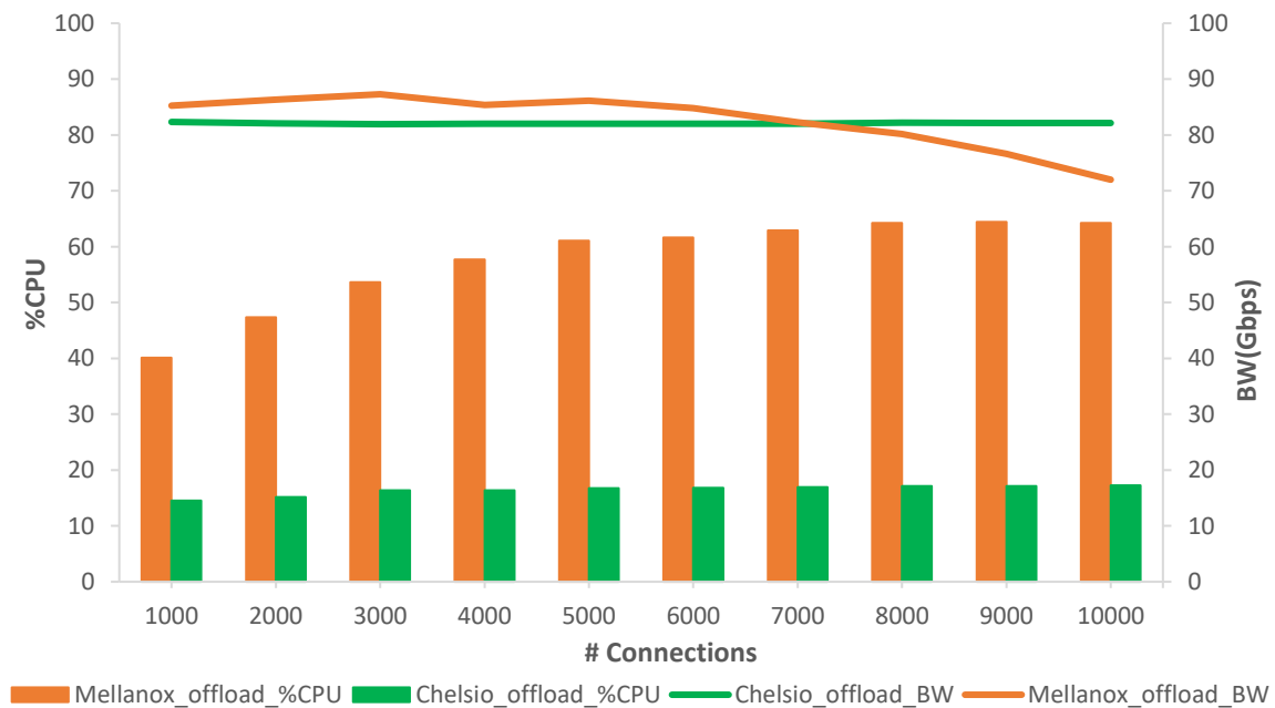
Figure 1 - Throughput & CPU Usage vs. # Connections

The following graph presents the %CPU and throughput results of NGINX Plus web server, using Chelsio T6 Inline TLS/SSL offload and Mellanox ConnectX-6 Dx kTLS offload. The numbers are collected using wrk tool with connections ranging from 1000 to 10000.